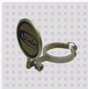
JPF metal mesh pop filter