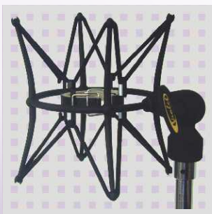
VSMJ spider type elastic shockmount