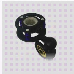
GSM compact shockmount