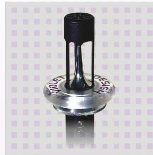
FRR The Reflection Ring