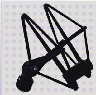
PSM elastic studio shockmount