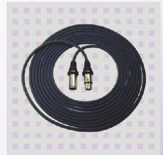
VMC-06 quad XLR3 microphone cable (6 m)

In the interests of product development, the specifications, construction and appearance of all above products are subject to change without prior notice and without obligation to install these improvements in any product previously manufactured.