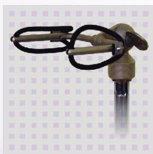
ASM elastic studio shockmount