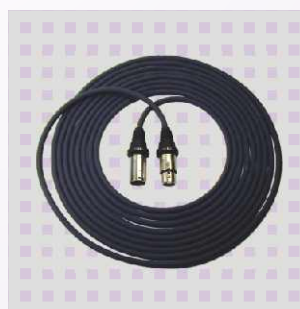
VMC-06 quad XLR3 microphone cable (6 m)

In the interests of product development, the specifications, construction and appearance of all above products are subject to change without prior notice and without obligation to install these improvements in any product previously manufactured.